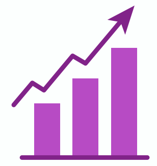
GDP of Pakistan can increase by 30% with increased female labor force participation (IMF report,2018)

WEXNET, also known as Women Exporters Network, is the largest women-exclusive exhibition platform created in 1999 to promote female entrepreneurship in Pakistan. Over the years, it has successfully organized exhibitions and workshops/seminars in 1999, 2001, 2002, 2003, 2005, 2006, 2010, 2014, and 2015.