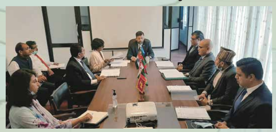
The High Commissioner, H.E. Major General (Retd) Muhammad Saad Khattak chaired a meeting of South Asia Co-operative Environment Programme on 25th September, 2020.