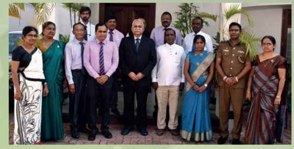
Visit of Sri Lankan Civil Servants to Pakistan

A 12-member delegation of Sri Lankan Government officers visited Pakistan from January 14 to 21, 2019, to gain comprehensive knowledge about Pakistan's Civil Services structure and policy formulation process. The visit was organized by the High Commission of Pakistan in collaboration with National School of Public Policy, Pakistan. The delegation members visited government institutions, Lahore and Taxila Museums, different educational institutions and Wahgah Border to observe the flag hoisting ceremony. The delegation also met high ranking government dignitaries during their stay at Pakistan.